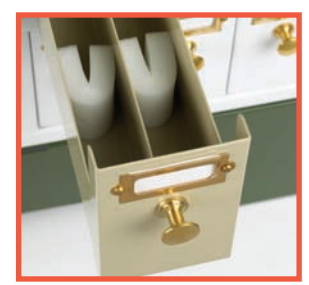
Brass pull knobs and card holders on each dual slotted drawer. Included foam inserts keep slides neatly standing.

B-Base: 402mm wide x 477mm deep x 129mm high (15.75" wide x 18.75" deep x 5" high)